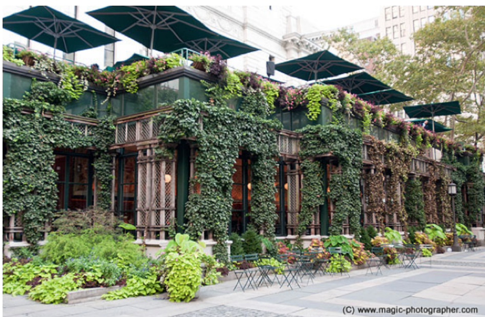
Refuge & Prospect : Bryant Park, New York City