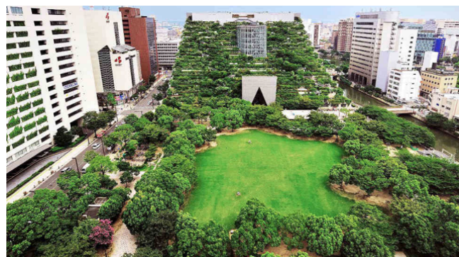
Acros Building, Fukuoka Japan