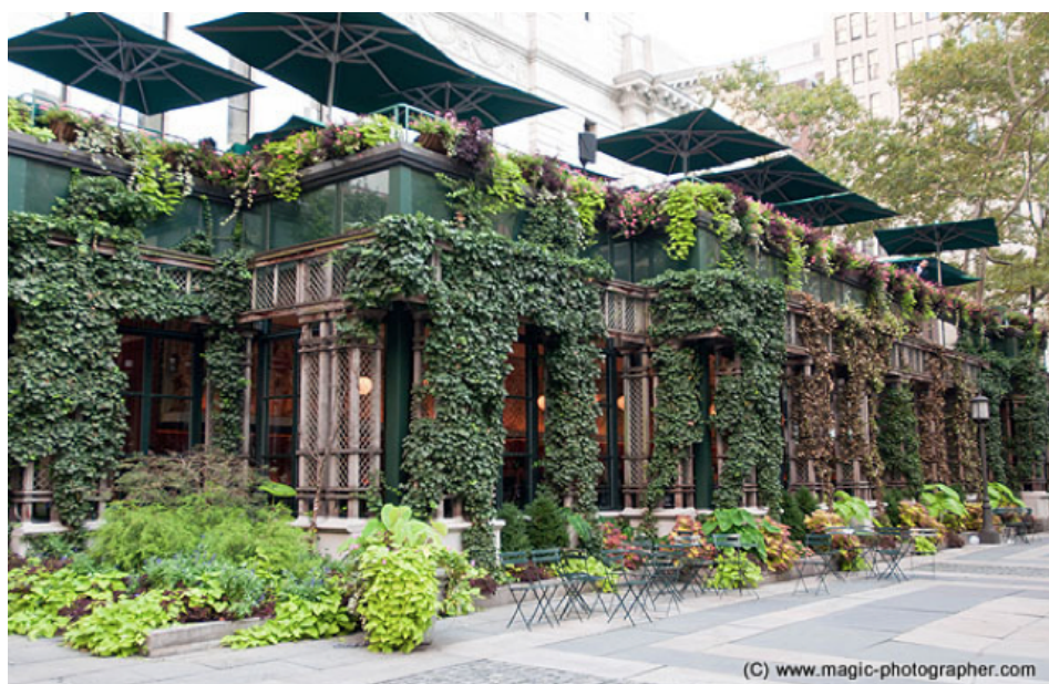
Refuge & Prospect : Bryant Park, New York City