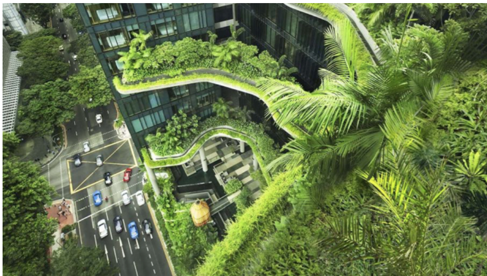
Park Royal Pickering, Singapore