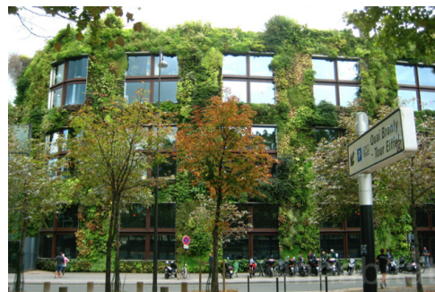
University of Pennsylvania Fagin Hall Green Roof Musee Du Quai Branly, Paris