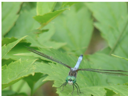
University of Pennsylvania Fagin Hall Green Roof