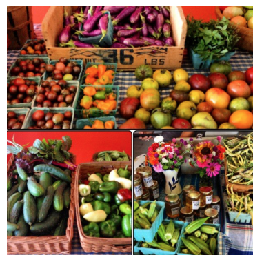
Harvest at the Brooklyn Grange, Farm on a Roof