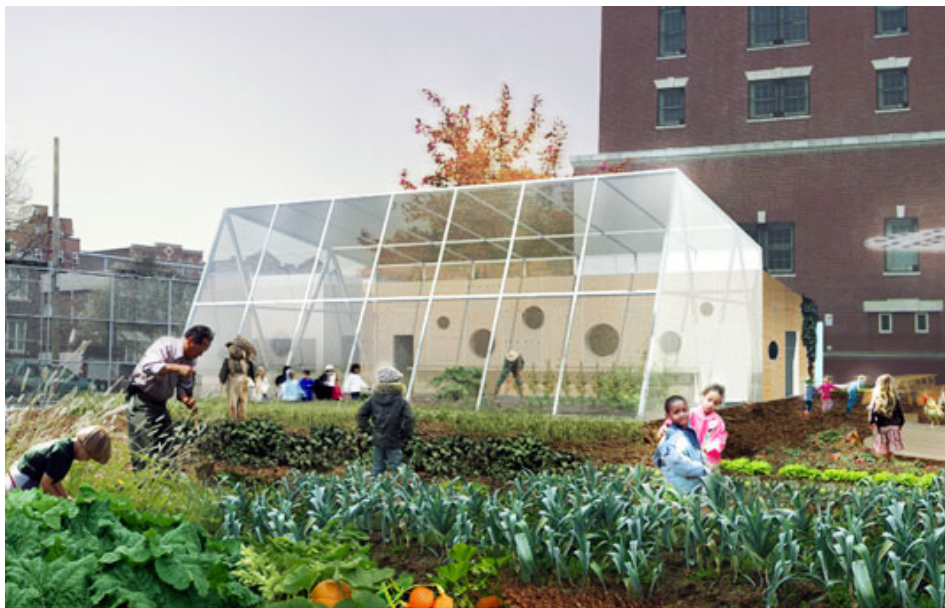
Project "Edible School Yard" NYC, Work Architecture