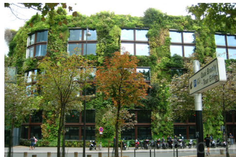
Musee Du Quai Branly, Paris