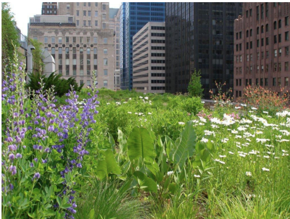
Chicago City Hall

We have finally made our well-being a priority. We have finally made community a priority. We have remembered our birthright to joy.