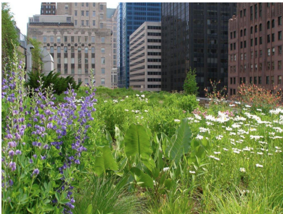
Chicago City Hall

We have finally made our well-being a priority. We have finally made community a priority. We have remembered our birthright to joy.