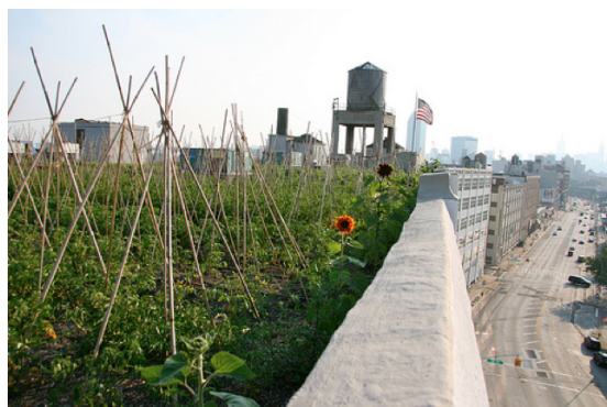
Brooklyn Grange Urban Farm. CLICK TO LEARN MORE.