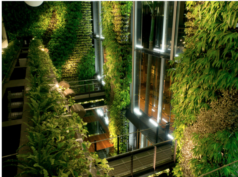
Interior 158 Cecil Street, Singapore

Not merely sustaining life, but growing life.